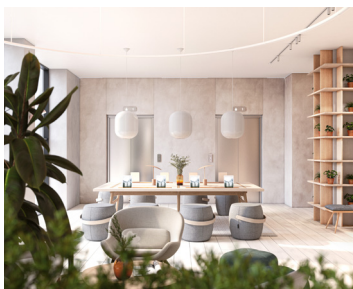
Sleep Prototype - Welcome Area