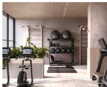
Sleep Prototype - Fitness Room