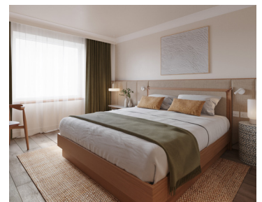
Sleep Prototype - Bedroom