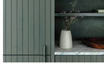
Uniformity of tone: Physical representation of natural environment - tactile, warm, muted.