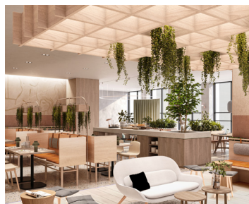
Sleep Prototype - Café Style Common Area