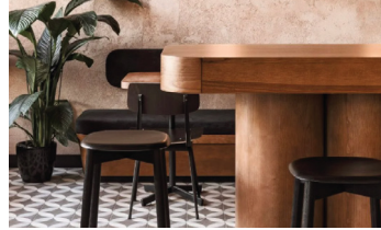
General styling: Simplicity with feature materials used in a considered way to obtain maximum impact.

Sleep's design is Inspired by Nature, balancing a calming restorative ambience with uplifting energy. This enhances our guests' sense of escape, and ensures they feel uplifted and well-rested, supported by a great nights' sleep.